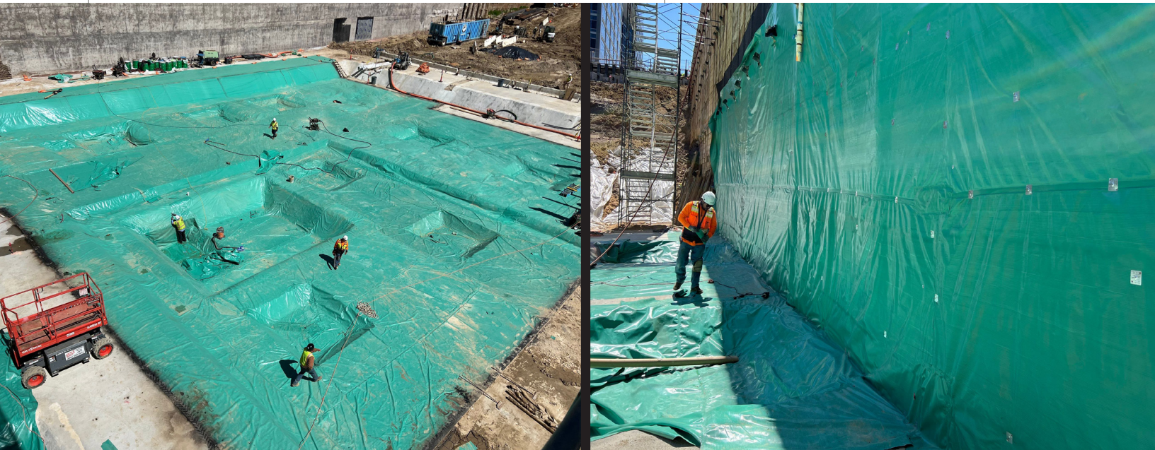
Installation at the walls.